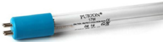
Figure: PURION UV Lamp 17W

...is characterized by compact construction and a high degree of efficiency respecting to disinfection and energy consumption. The construction design follows laws, standards and regulations.